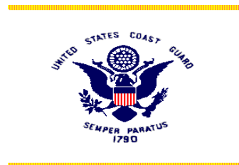
U.S. COAST GUARD

Talk with Congressman Dent, staff from Senator Toomey's office and representatives of the Air Force, Naval, Merchant Marine and Coast Guard Academies, the U.S. Military Academy at West Point and the R.O.T.C. to gain a better understanding of the nomination and admission process.