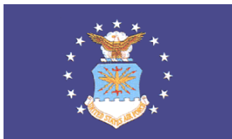
U.S. AIR FORCE

For more information please call Sue at (610) 434-1444 or Jason at (610) 562-4281